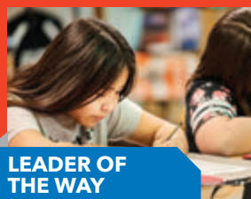
LEADER OF THE WAY

This can provide a Chromebook plus food for one student so they can be successful in school.