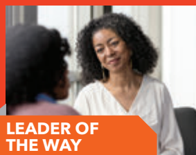
LEADER OF THE WAY

This can provide one student with full wrap-around support services for one year.