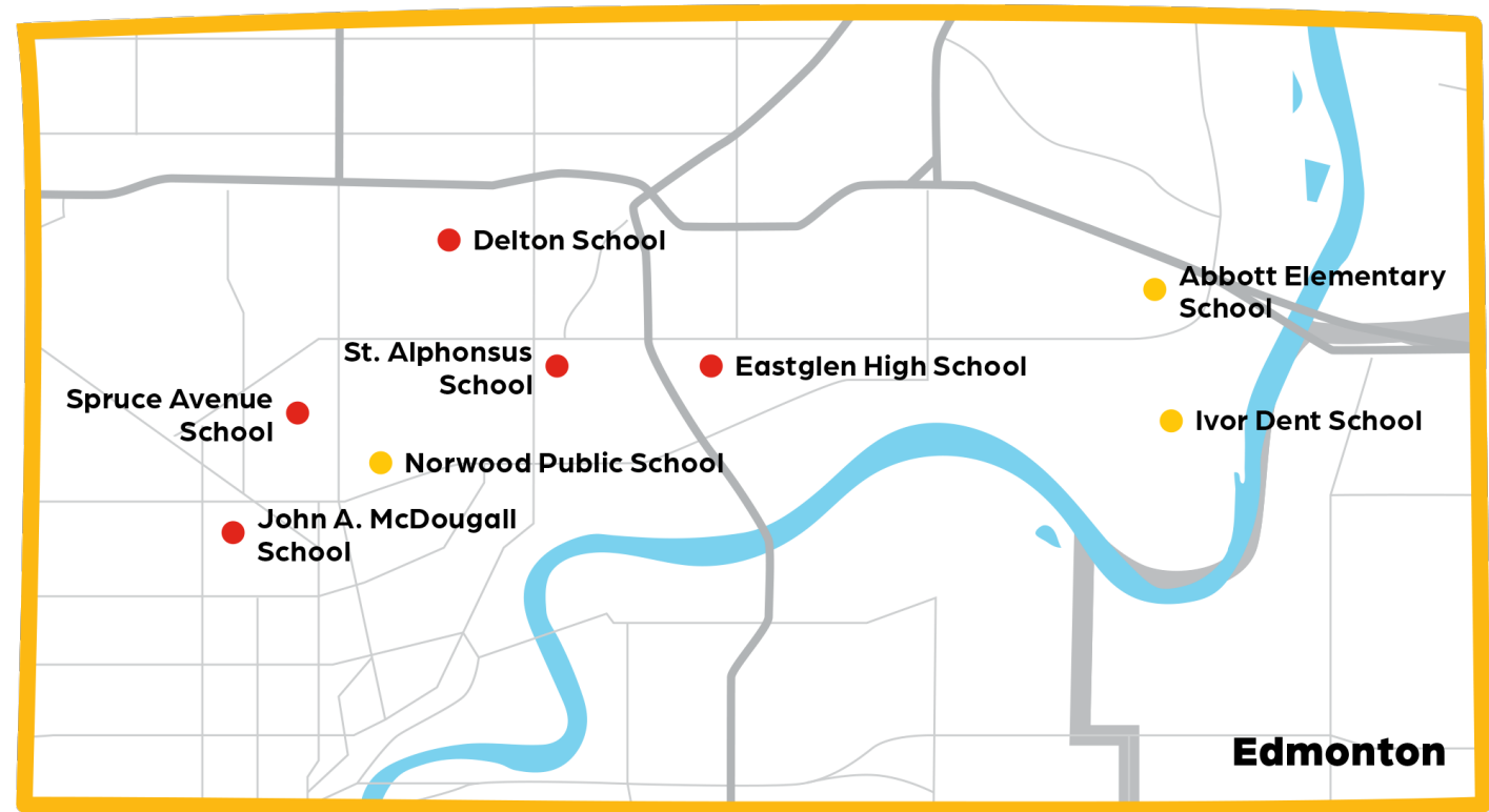
Years the Schools joined the Initiative: ● 2016 ● 2021

In Year 8, more than 3,000 students and their families were part of eight AIFY school communities. Together, these schools include students from Kindergarten to Grade 12 in Edmonton Catholic and Edmonton Public school divisions.