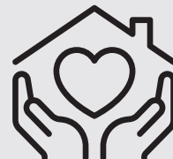
Roots and Wings in-home support

Last school year, almost all AIFY students accessed nutrition support, while 50% took part in at least one other service.