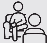
Child and family mental health therapy